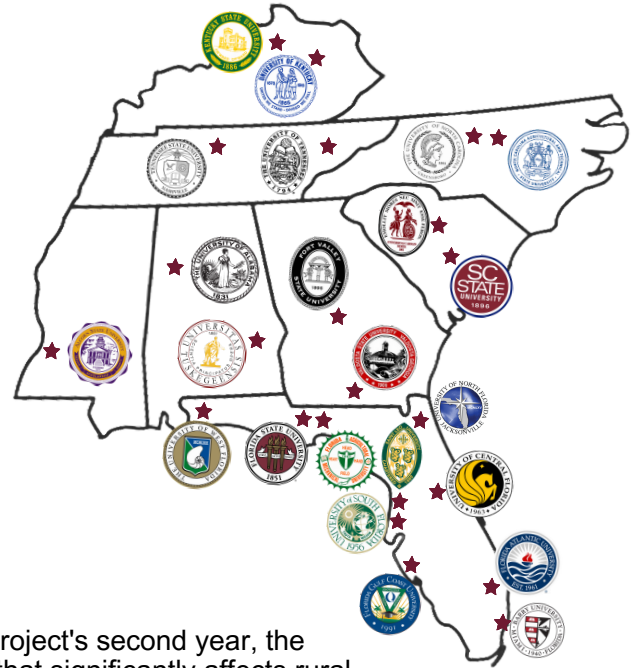
Southeastern Higher Education Rural Opioid Consortium Map

ROTA-RC develops and disseminates training and technical assistance to address opioid and stimulant use affecting rural communities in the eight states in Region 4. We expand awareness of opioid and stimulant use, harm reduction, and options for treatment in collaboration with our Southeastern Higher Education Rural Opioid Consortium (pictured to the right).